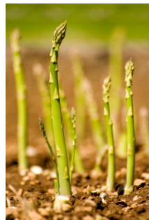
Spears: Peak Harvest

Asparagus is a perennial crop with a short window during which crowns should be harvested to ensure peak freshness and nutrition. During a single season, asparagus can go through 2-3 consecutive cuttings before going to seed or being chopped for the following season.